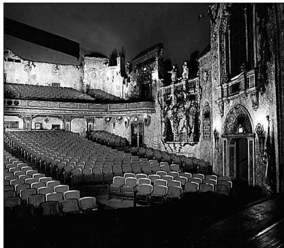
View of the Palace Theatre in Marion.

March 5 — Art & Culture Walk , downtown Marion, 4-8 p.m. (740) 244-9567.